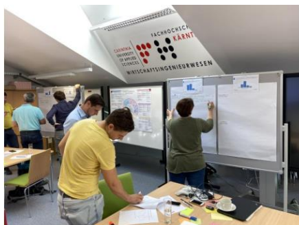
Participants during the workshop

On the 23 rd of June, a working group composed of members of Stadt Villach, FH Kärnten, Kelag and Infineon met up to work on the qualitative evaluation of the first iteration of Villach's demonstrator, based on 52 test drives.