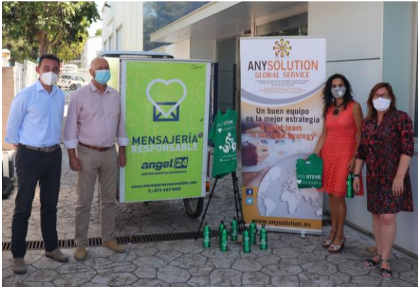
AnySolution's team meeting with representatives of Angel24

One of the mitigation measures taken in Mallorca and implemented by AnySolution has been to identify a delivery company (Angel24) which was already interested in promoting sustainable mobility. Angel24 is a company that within its Corporate Social responsibility strategy has included the use of ELVs for product delivery in the municipality of Palma de Mallorca (Spain). This best practice fits perfectly within the aims of the STEVE project and will now be smarter thanks to the use of the SAMAY App helping to increase energy efficiency in their routes.