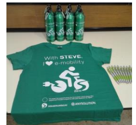
STEVE Merchandising in Calvià

Due to COVID19, contingency measures have been implemented by AnySolution for Calvià's pilot: the geographical coverage of the pilot has been expanded (now also including the municipality of Palma in addition to Calvià) and two additional target groups (commuters to the University of the Balearic Islands and a delivery company using LEVs) have been added to residents and tourists. Merchandising has been produced so as to encourage e-bike users to download the SAMAY App and fill out the STEVE questionnaire.