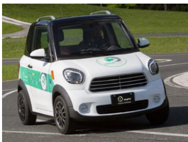
On-track testing of STEVE EL-Vs

Elaphe's proprietary Propulsion control Unit and in-wheel motor technology was tailored to the specific need of the EL-Vs in STEVE. The main goal is to gain maximum overall performance and increased reliability, while implementing cost effective solution. The test campaign run in realistic conditions has provided useful data for further performance optimization.