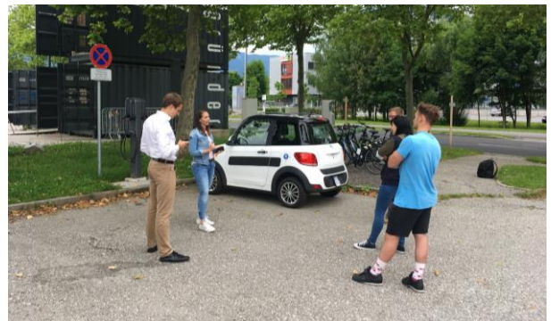
Training of test-users in Villach

The second phase with the car-sharing service will run until October 2020 in Villach and it is expected to receive good feedback on the services and to get useful data regarding mobility behaviors